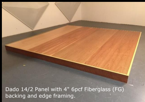
Dado 14/2 Panel with 4" 6pcf Fiberglass (FG) backing and edge framing.