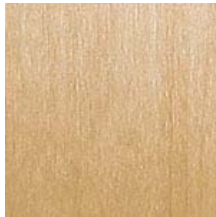
UNIFORM WHITE BIRCH