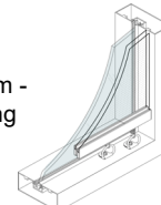
Dual Layer System - Hem Bar Mounting