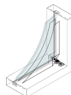
Dual Layer System - Grommet Mounting

Clearsorbor® Foil-Dual Layer is best mounted under tension for clean lines and maximum transparency. The simplest and most cost effective tensioned mounting system utilizes stainless steel grommets at each corner of the Foil panel which is captured by a spring and finally stretched to an attachment point. A hem bar mounting is also available and is recommended when longer spans are required. The system can also be mounted as a lapendary style system for a draping effect.