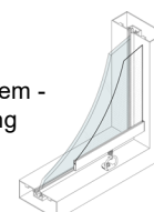
Single Layer System - Hembar Mounting