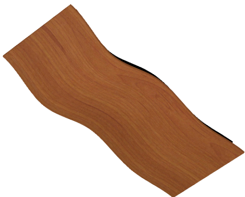
Waveform® Spline W