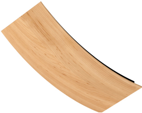
Waveform® Monoradial W