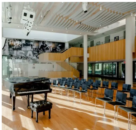
Harlem School of the Arts - Renaissance Project WSDG, New York