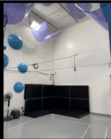
A Mount - Corner Loading