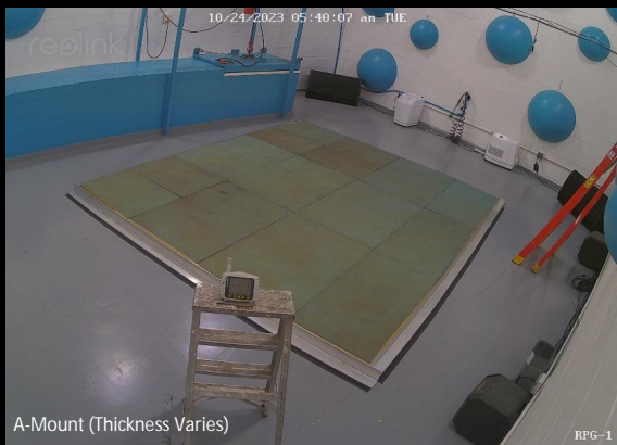
A-Mount (Thickness Varies)