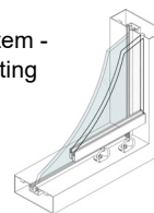
Dual Layer System - Hem Bar Mounting